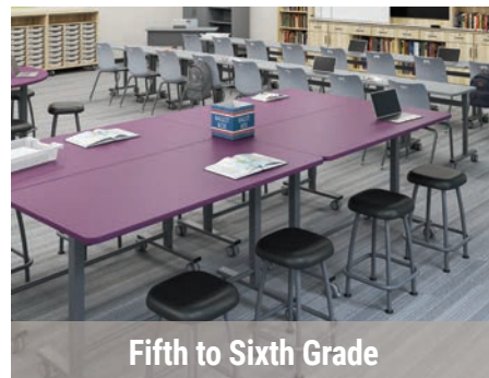
Fifth to Sixth Grade