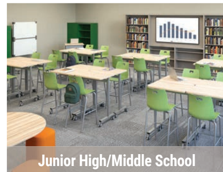
Junior High/Middle School