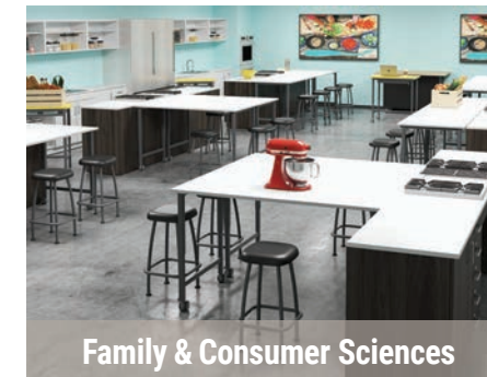
Family & Consumer Sciences