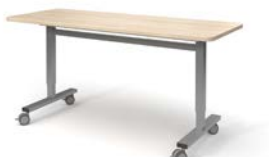
FLIP & NEST