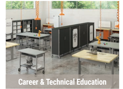
Career & Technical Education