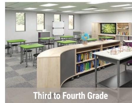
Third to Fourth Grade