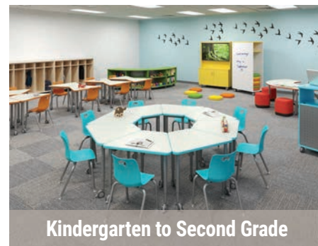
Kindergarten to Second Grade